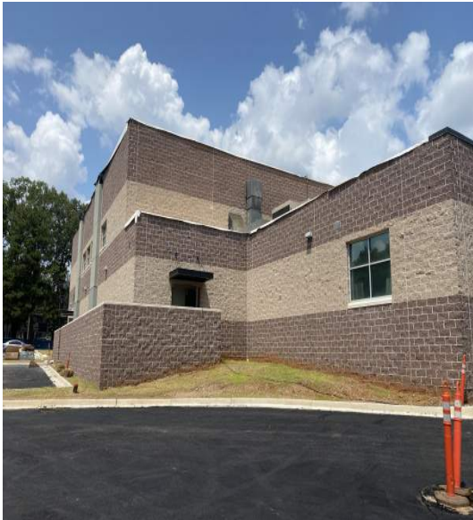
Curbs and paving completed