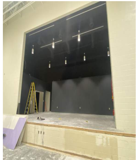
Stage area painting completed