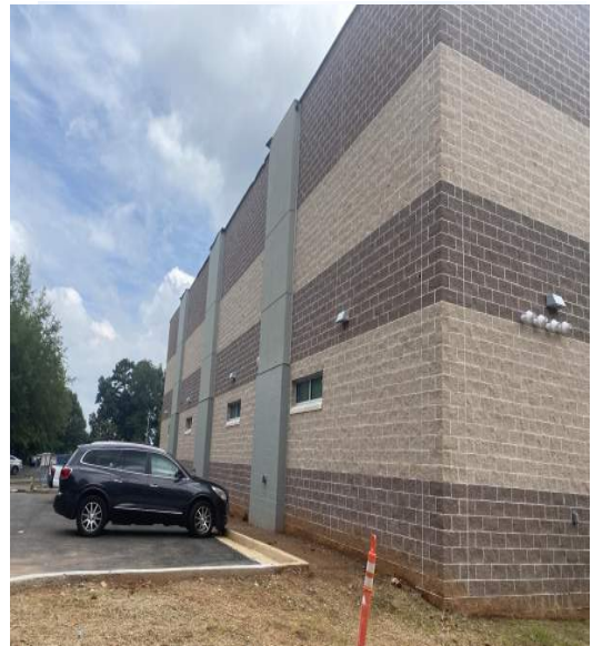
Painting on bump-outs complete