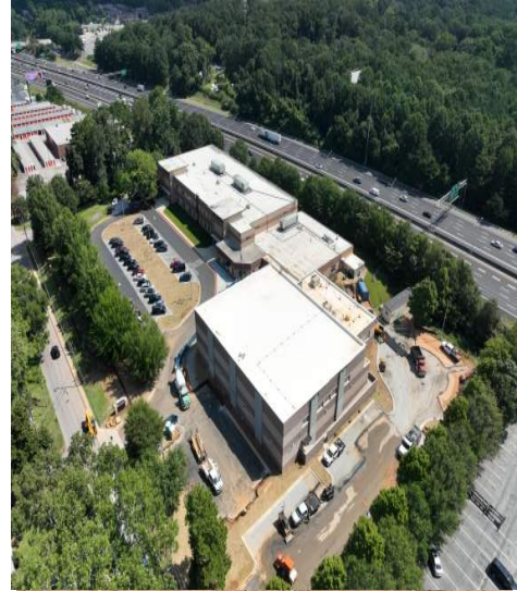
East side exterior view